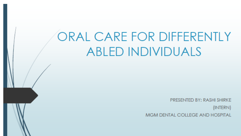
Screenshot of Presentation

Thus, similar kind of activity was extended to participants of Stepsworth Physiotherapy & Rehabilitation Clinic, Thane. The activity involved a detailed talk on Oral Care of Differently Abled Individuals. Online session was conducted by speaker Rashi Shirke. The session included a high level of interaction between the participants & the speaker. The speaker used evidentiary support with varied AV aids to educate the participants.