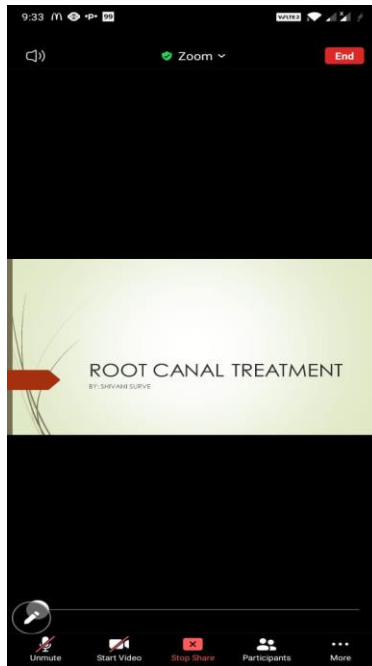
Screenshot of presentation