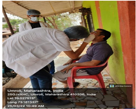
TEAM MEMBERS AT THE CAMP SITE

Umroli, Maharashtra, India 25GJ+XHC, Umroli, Maharashtra 410206, India Lat 19.027513° Long 73.181337° 25/03/22 10:49 AM