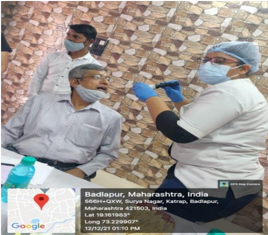
ORAL HEALTH CHECK UP BEING DONE