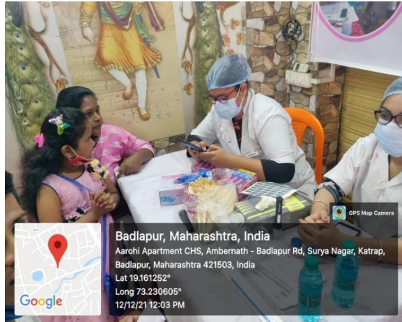
COUNCELLING BEING DONE BY THE TEAM MEMBER