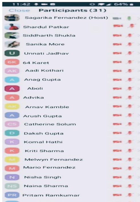
List of attendee