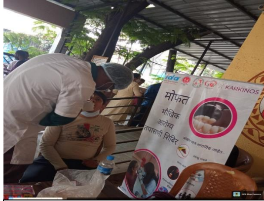
INVESTIGATION BEING DONE BY THE TEAM MEMBER