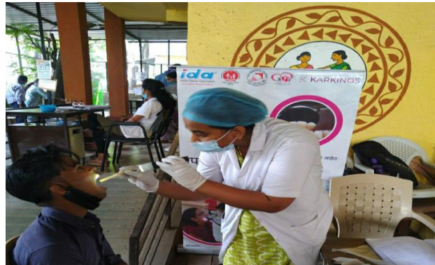
TEAM MEMBERS AT THE CAMP SITE