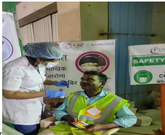
TEAM MEMBERS AT THE CAMP SITE