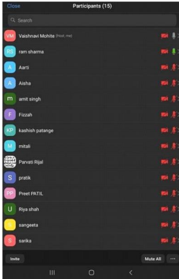
Screenshot of Attendees