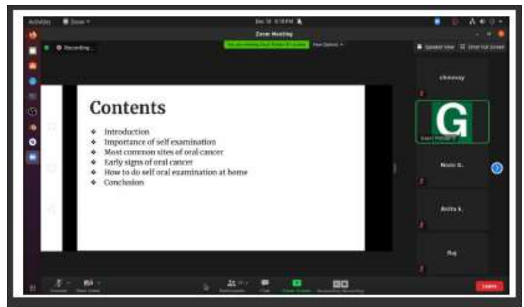
Screenshot of Presentation