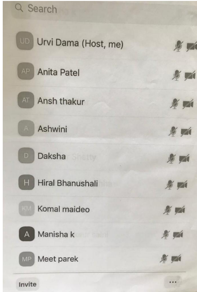
Screenshot of Attendees